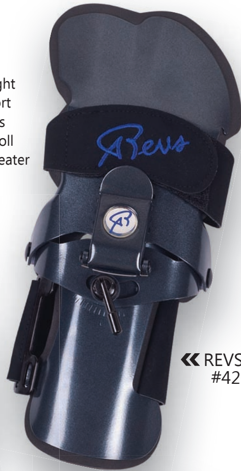
« REVS 1 #420