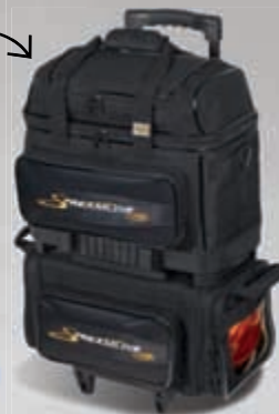
4-BALL STREAMLINE Black