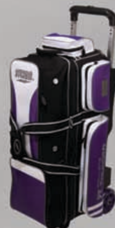
3-BALL ROLLING THUNDER Purple/White