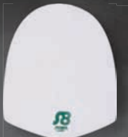
S8 PD818 White Microfiber. Long Slide.