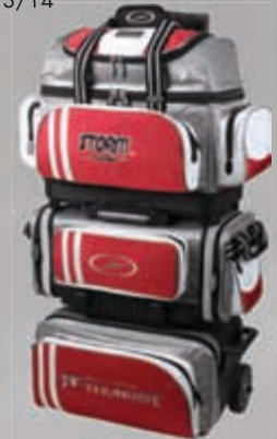
6-BALL ROLLING THUNDER Red/White