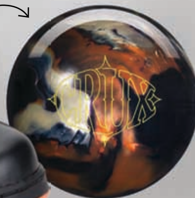
CRUX PEARL Black/White/Copper