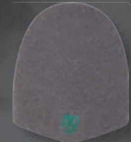
S10 PD820 Grey Felt. Longest Slide.