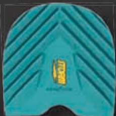
H2 PD822S(S) PD822L(L) Ultra Brakz. More Brake.