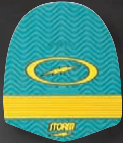
T3+ PD921S(S), PD921(L) HyperFlex-Zone Traction Rubber. Average Traction