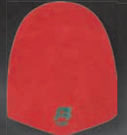
S4 PD814 Red Leather. Short Slide.