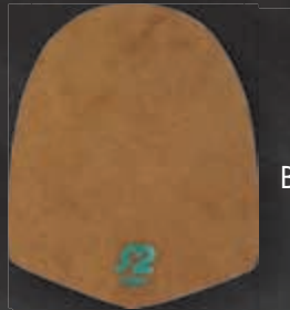
S2 PD812 Brown Microfiber. Less Slide.