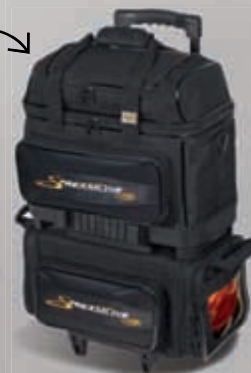
4-BALL STREAMLINE Black