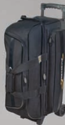
3-BALL STREAMLINE Black