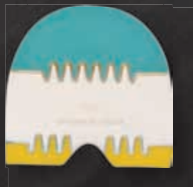
H5 PD823S(S), PD823M(M), PD823L(L) Saw Tooth. Standard Brake.