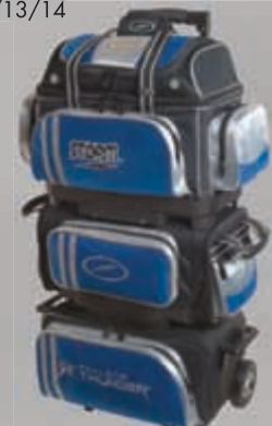
6-BALL ROLLING THUNDER Blue/Silver