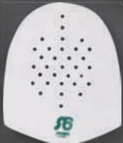
S6 PD816 White Microfiber. Long Slide.