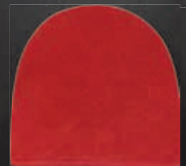
H7 PD824 Red Leather. Least Brake.