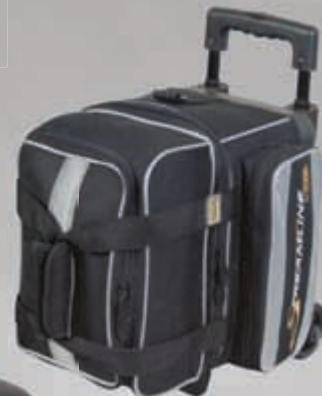
2-BALL STREAMLINE Black/Grey